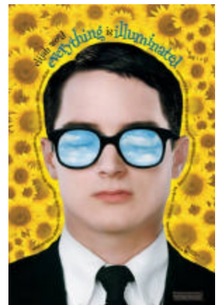
Everything Is Illuminated