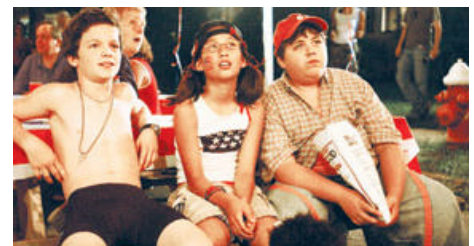
Twelve and Holding