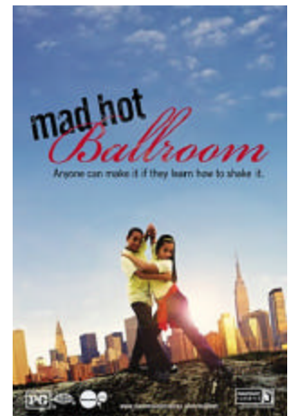
Mad Hot Ballroom

Director Jeff Stanzler. Cast: Robin Wright Penn.